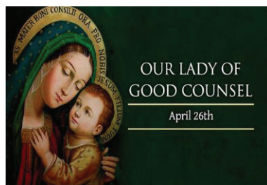
OUR LADY OF GOOD COUNSEL April 26th